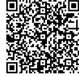
Scan to fill out online newcomer form.

If you are new to St. John's, or have been attending a while but the parish office doesn't yet have your information, please fill out our online newcomer form by scanning the QR code or going to sjparish.net/newcomer