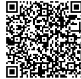
Scan to fill out online newcomer form.

If you are new to St. John's, or have been attending a while but the parish office doesn't yet have your information, please fill out our online newcomer form by scanning the QR code or going to sjparish.net/newcomer