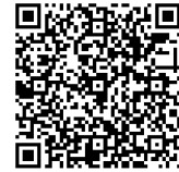
Scan to fill out online newcomer form.

If you are new to St. John’s, or have been attending a while but the parish office doesn’t yet have your information, please fill out our online newcomer form by scanning the QR code or going to sjparish.net/newcomer