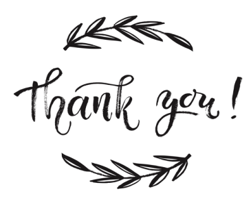
This list includes pledges received as of Thursday, December 14. The names of new pledgers are in italics.