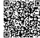
Scan to fill out online newcomer form.

If you are new to St. John’s, or have been attending a while but the parish office doesn’t yet have your information, please fill out our online newcomer form by scanning the QR code or going to sjparish.net/newcomer