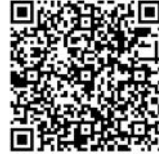
Scan to fill out online newcomer form.

If you are new to St. John’s, or have been attending a while but the parish office doesn’t yet have your information, please fill out our online newcomer form by scanning the QR code or going to sjparish.net/newcomer