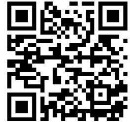
Scan to fill out online newcomer form.

If you are new to St. John’s, or have been attending a while but the parish office doesn’t yet have your information, please fill out our online newcomer form by scanning the QR code or going to sjparish.net/newcomer-form .