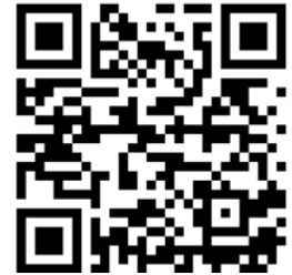
Scan to fill out online newcomer form.

If you are new to St. John's, or have been attending a while but the parish office doesn't yet have your information, please fill out our online newcomer form by scanning the QR code or going to sjparish.net/newcomer-form .