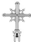
Cover image: He is Risen by He Qi

Children are always welcome to be in church with their families. We encourage you to sit up front, as they will be more engaged if they can see and hear what's going on. Children are welcome here just as they are; please don't feel you must leave every time your little one makes a sound! We have children's bulletins, books, and other quiet activities available in the narthex (the entrance with the red doors) for children's use during the service. A nursery staffed by high school students is available on Sunday mornings from 9 a.m. to noon. Parents are also welcome to use the nursery if you need a changing table or a quiet spot. Sunday School for all ages is at 9:30 a.m.