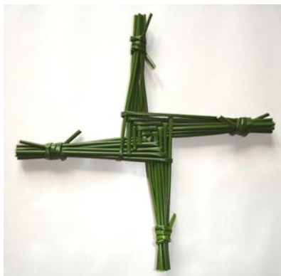
Image of Saint Brigid's cross, made from rushes from County Down Sony P-200 and Jasc Paint Shop Pro 9

Meetings will be the next three Sundays, February 11, 18, and 25 at 4:30pm at St. James's Church in West Hartford. Please purchase the book and read chapters 1 and 2 before our first meeting on February 11. All are welcome!