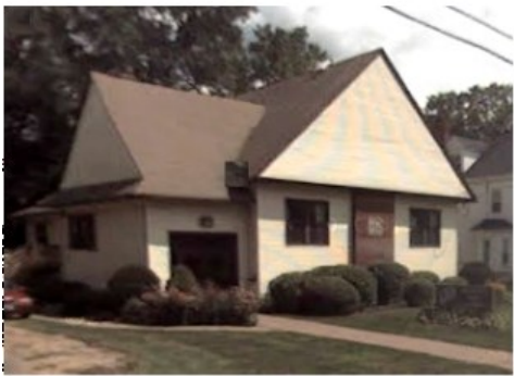
Prospect Bible Chapel Today

Q. The last services at St. John's Hartford were held on Easter Day, 1907, but our present building did not open until two years later. What happened to the parish in between?