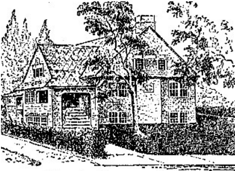
Chapter House as Built